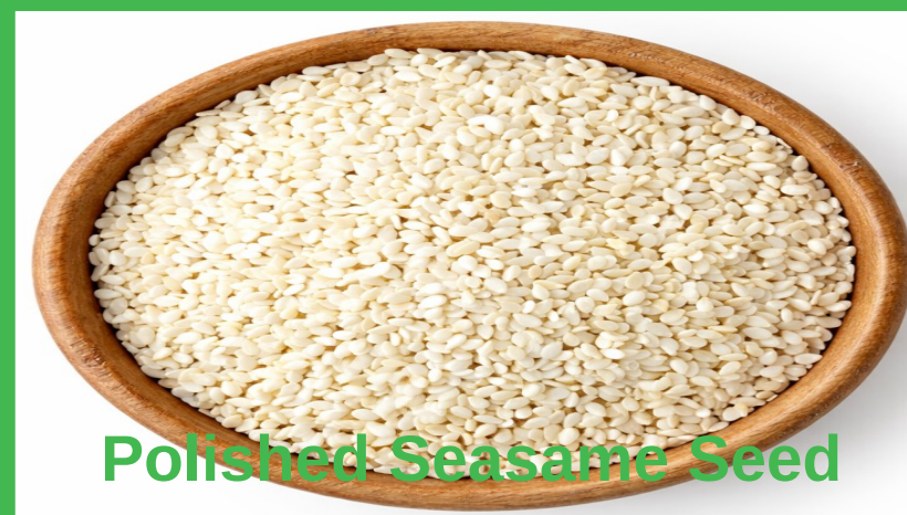
Polished Sesame Seed