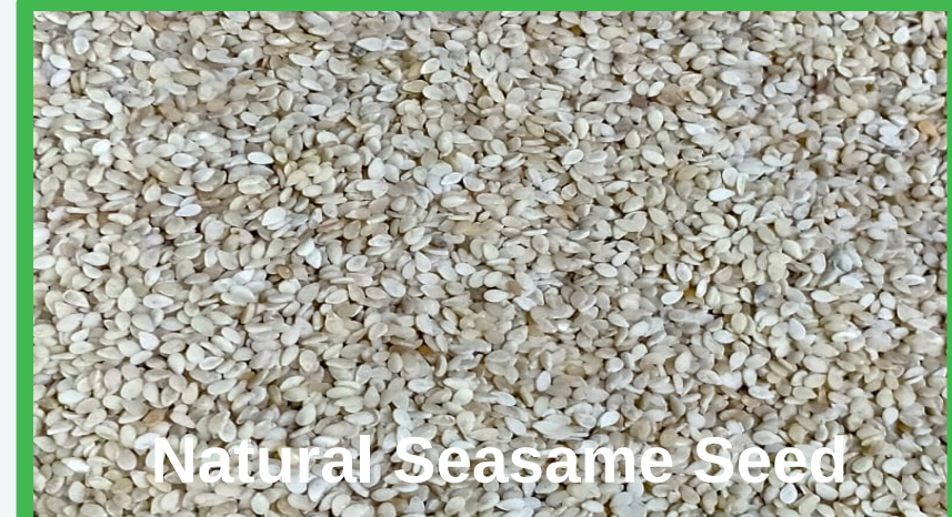
Natural Sesame Seed