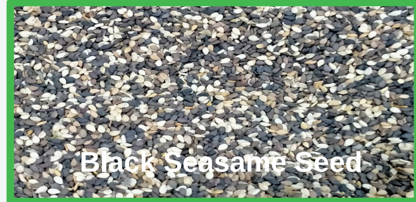
Black Sesame Seed