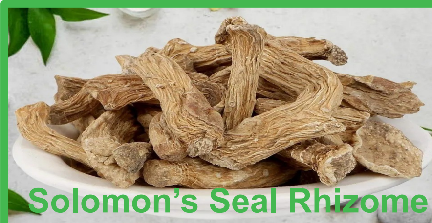
Solomon's Seal Rhizome