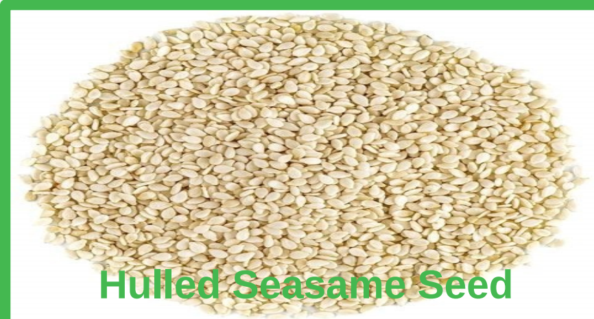
Hulled Sesame Seed